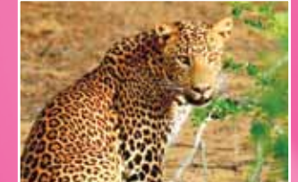
Yala National Park