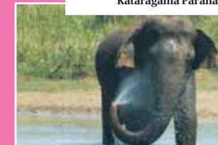
Udawalawa National Park