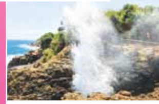
Blow Hole (Hummanaya)