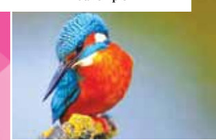
Bundala Bird Sanctuary