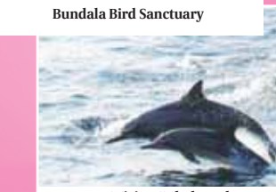
Mirissa Whale and Dolphin