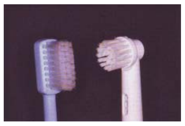
Fig. 2 Toothbrushes

Manual brushes with small heads and soft bristles, and rotation-oscillation type powered brushes are effective designs to remove plaque.