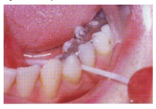
Dental floss or dental tape is required for removing plaque from interdental tooth surfaces.